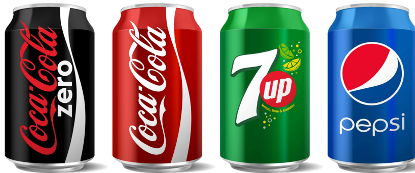
COCA-COLA, 7-UP, PEPSI, DR. PEPPER, FANTA