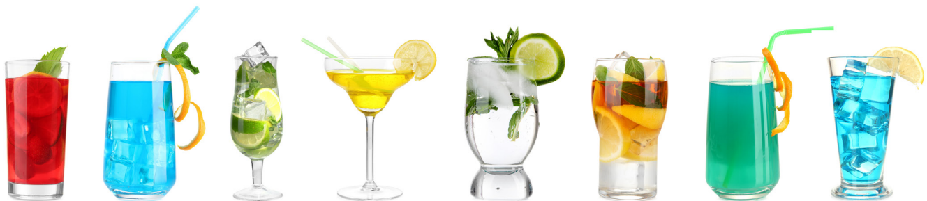
STRAWBERRY COCKTAIL, AMERICANO, BELLINI, ROSSINI, GIN AND IT, APEROL SPRITZ