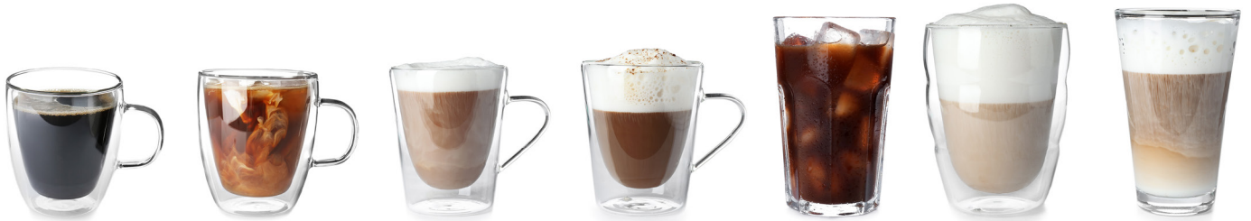
COFFEE, 1% MILK, 2% MILK, WHOLE MILK, CHOCOLATE MILK, WATER